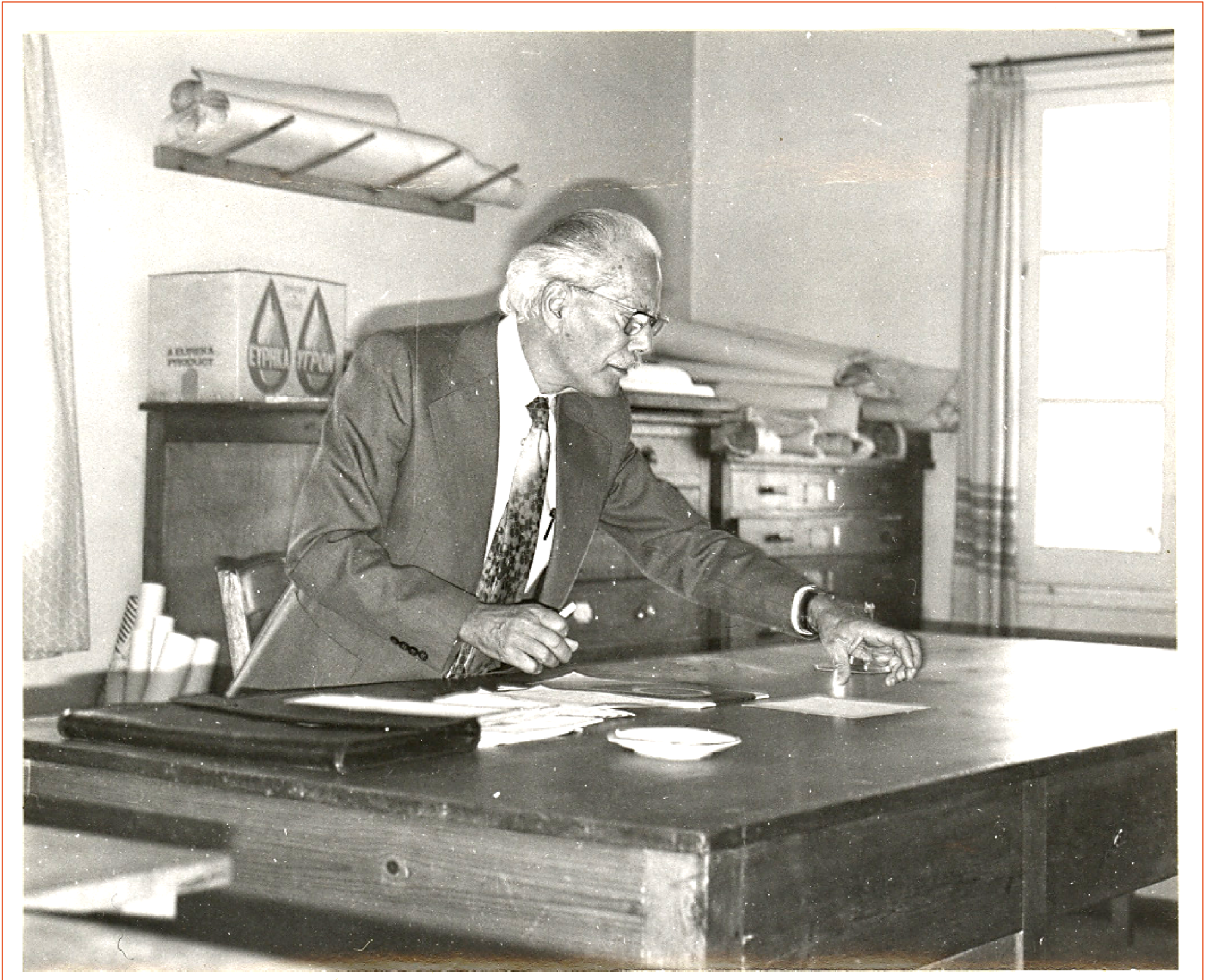
Lecture in Nicosia in 1971