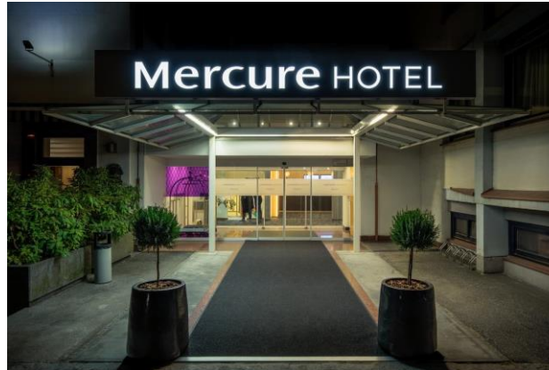
Hotel Mercure Maribor City Center Ulica heroja Šlandra 10, Maribor